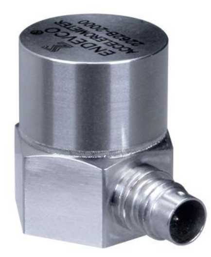
Figure 1: The Endevco® 2262B Damped Accelerometer (photo not to scale)

The Endevco® Model 2262B is a rugged, gas-damped piezoresistive transducer. It has an integral hermetic receptacle that is designed to mate with a detachable shielded cable assembly (Endevco® Model 3915). The sensing element itself is a silicon MEMS element used in a full-bridge configuration. This model is designed for high-shock applications with gas damping to reduce resonance excitation, and overtravel stops are employed to reduce breakage in overrange conditions. These two features combine to offer more survivability and reliability in environments that may not be well defined.